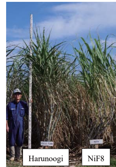
Fig. 1. Harunoogi and NiF8 Photos taken in November 2018 in Nishinoomote, Japan

Japan International Research Center for Agricultural Sciences