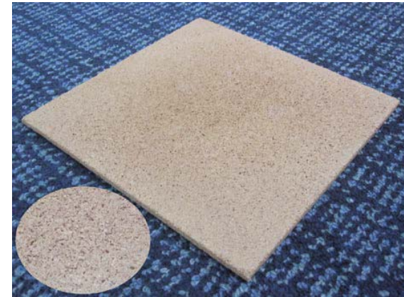
Fig. 1. Image of the binderless particleboard made from oil palm trunk (The magnified image of the surface is shown inside the circle.)

(Tomoko Sugimoto, Rokiah Hashim [Universiti Sains Malaysia (USM)], Othman Sulaiman [USM], Masatoshi Sato [the University of Tokyo])