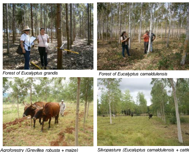
Figure 2. Photographs of established forest in the A/R CDM project in Paraguay