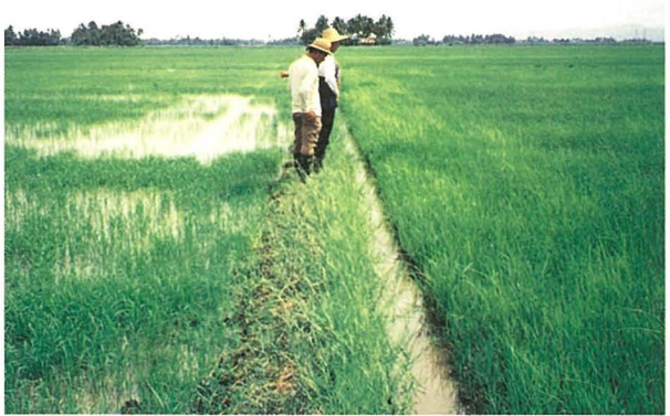
Use of an auger trencher for making ditches in a field (top) and fields with ordinary drainage (left) and field with ditches dug by a machine (right bottom)