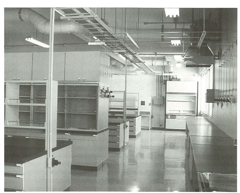
The new laboratory equipped with advanced facilities for TARC Visiting Research Program at Okinawa Branch

The research results will contribute to a more intensive use of vegetatively propagated crops in the tropics and subtropics.