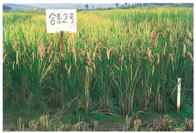
New registered Variety Dian Jing No. 23