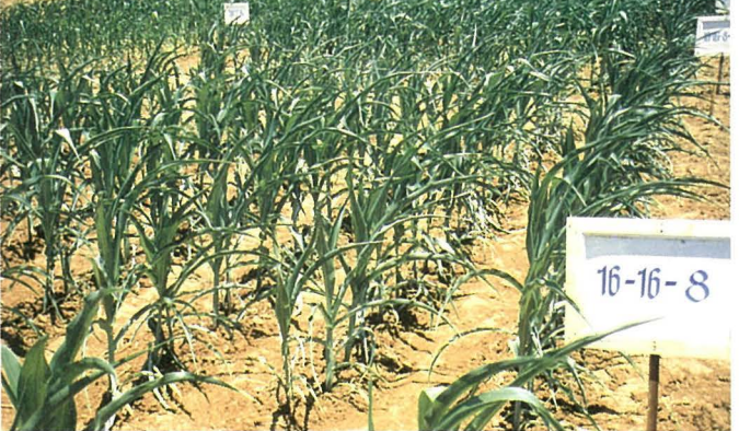
Maize grown with (A) and without (B) plant residue mulch.

resistant to all the isolates inoculated. To classify them further into subgroups, the varieties of Group VII were inoculated with eight isolates which were virulent to the varieties carrying at least one of the following genes, i.e., Pi-z , Pi-ta <sup>2</sup>, Pi-z <sup>1</sup> and Pi-b . Varieties of Group VII were divided into four subgroups. Group VII-1 and VII-2 may carry the gene Pi-b , Pi-b and another gene or genes, respectively. Varieties of Group VII-3 may carry the gene Pi-z' .