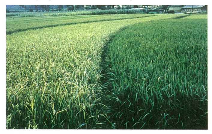
Rice blast occurrence. The variety in Field B Shows a high level of resistance while the variety in Field A is severely damaged.

Twenty-eight varieties of the Group VII were found to be