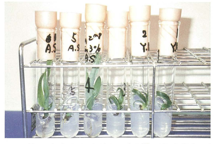
Pineapple clones growing in test tubes

Thus, the application of this improved technique enabled to preserve pineapple clones for several years in vitro . This technique can also be used for the preservation of other genetic resources of vegetatively propagated crops in the tropics.