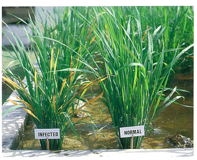
Rice infected with Tungro Spherical Virus (Left: diseased plant, Right: normal plant)

about 15°C and the average temperature in January and February in Ishigaki Island ranges from 17 to 18°C, it is assumed that the bug develops at a low rate during this period.