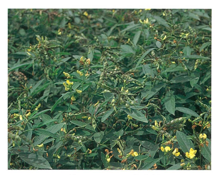
Pigeonpea grown on Alfisol.

In the tropics where many soils are highly weathered, P is strongly bound to iron compounds and its availability is extremely low. Crop production is quite often seriously limited by the low availability of P in soils. Introduction of pigeonpea into cropping systems in a tropical area should contribute to the stabilization of crop productivity by promoting efficient utilization of soil P.