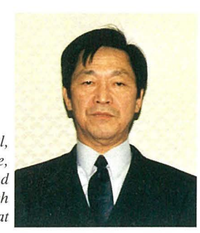
Director General, Agriculture, Forestry and Fisheries Research Council Secretariat

The remarkable achievements realized hitherto were undoubtedly made possible through the invaluable cooperation extended by the organizations involved. In