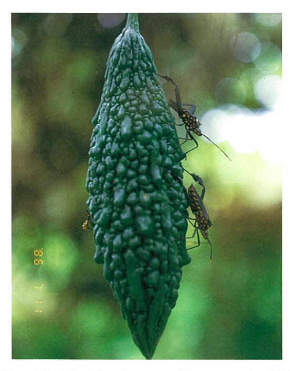
Leaf-footed Plant Bug infestation on cucurbits at an experiental field of Okinawa Branch.

Omura et al. (1983) purified the viruses and produced antisera to each virus. Enzyme-linked immunosorbent assay (EL-ISA) was introduced in the screening of the resistant varieties. Seedlings of each variety, seven days old, were inoculated with viruliferous GLHs (1 or 1.5 GLH per seedling) in a translucent