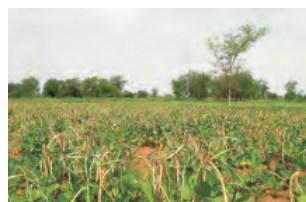
Photo 1. Cowpea field ready for harvesting (Pobe Mengao, Burkina Faso)

Through multi-party collaboration between JIRCAS, IITA, and INERA, we expect to develop suitable cowpea varieties with better productivity and in accordance with the required quality. We hope that the research outcomes will help promote rural livelihood improvement through enhanced food safety and income generation especially among poor farm households in the regions.