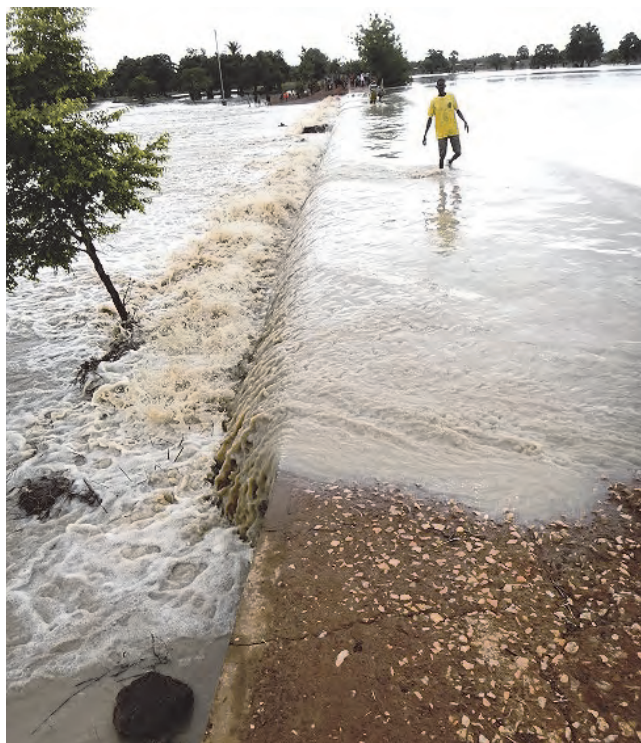
Photo 4. Floodwaters inundate roads and lowlands after a rainfall event (July 2012)