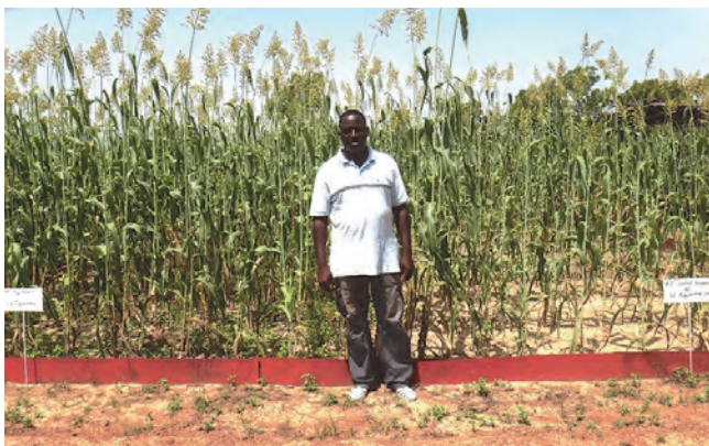
Photo 1. Soil erosion experiment on sloping plots (left: partial tillage + residue mulch; right: full tillage + residue removal). Lower plant growth is obvious at upslope full tillage treatment plot probably due to higher soil erosion rates.