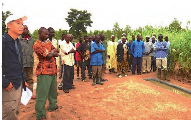
Photo 3. Exchange of opinion with farmers