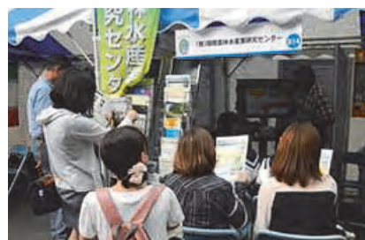
Communication time (Oct 4)

Global Festa JAPAN 2014 took place at Hibiya Park on 4-5 October (Fri-Sat); however, it was cut short on the second day due to stormy weather.