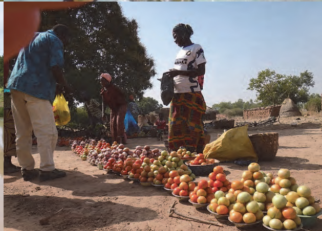
Rural life in Burkina Faso, West Africa