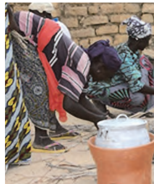
Photo 1. Women are preparing firewood as fuel for the ceramic ICS.

※ This project is funded by the Ministry of Agriculture, Forestry and Fisheries of Japan.