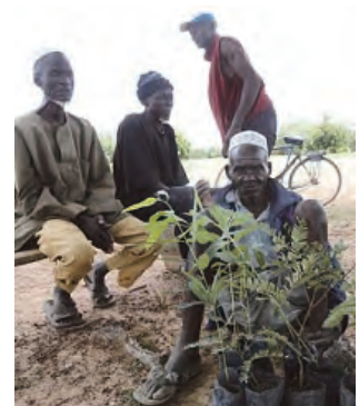
Photo 2. Nere seedlings and Burkinabe farmers