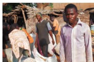
Photo 3. Cowpea traders packing cowpea grains for export to Côte d’Ivoire (Tifora, Burkina Faso)

Satoru Muranaka Tropical Agriculture Research Front