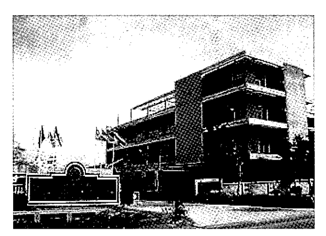
Training Dept., Bangkok

This concept is not limited to the issues that SEAFDEC faces. Development of ownership of programs