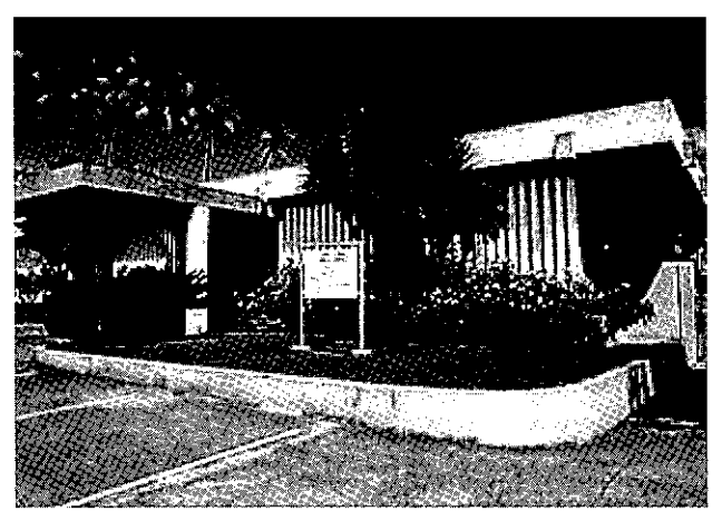
Aquaculture Dept., Tigbauan, Iloilo